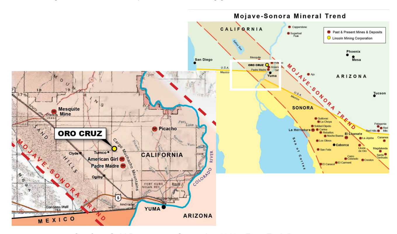
Oro Cruz Gold Resources - September 2010 - Tetra Tech Report

In September 2010, Lincoln filed a NI 43-101 technical report. Oro Cruz has an Inferred resource estimate of 376,600 ozs gold, grading 0.050 opt gold at a 0.01 opt cutoff grade. The existing pit and underground decline expose gold mineralization. Previous work has identified multiple exploration targets and Lincoln has identified several satellite gold zones, which offer potential for increasing gold resources.