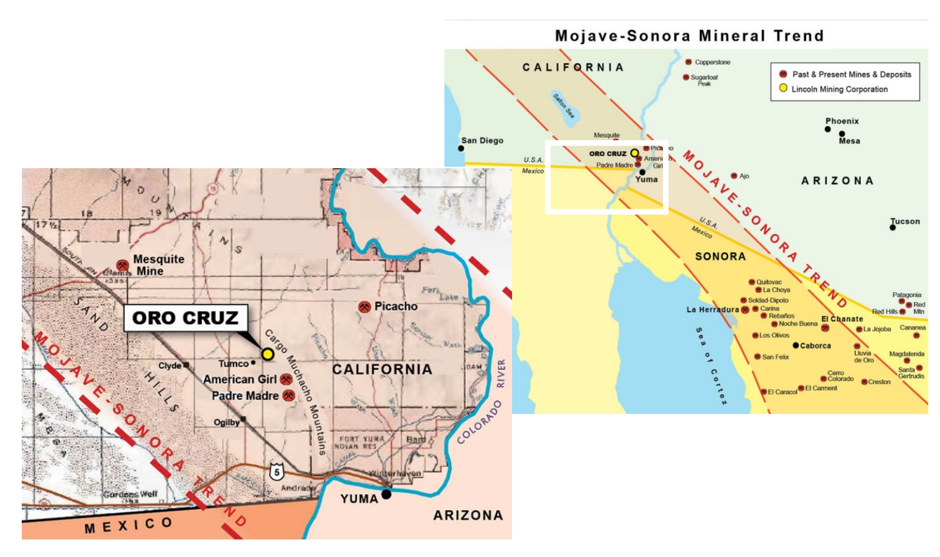
Oro Cruz Gold Resources - September 2010 - Tetra Tech Report

In September 2010, Lincoln filed a NI 43-101 technical report. Oro Cruz has an Inferred resource estimate of 376,600 ozs gold, grading 0.050 opt gold at a 0.01 opt cutoff grade. The existing pit and underground decline expose gold mineralization. Previous work has identified multiple exploration targets and Lincoln has identified several satellite gold zones, which offer potential for increasing gold resources.