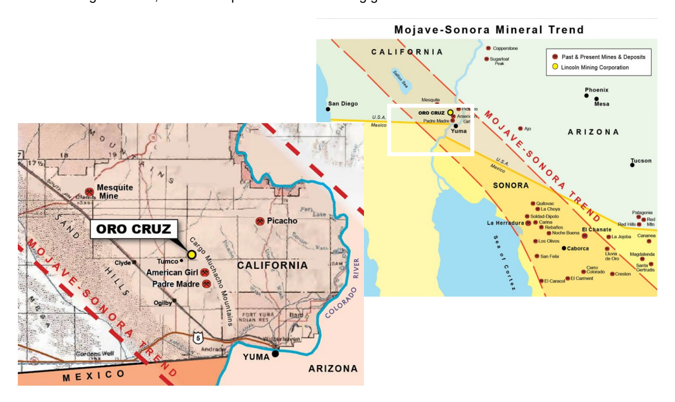
Oro Cruz Gold Resources - September 2010 - Tetra Tech Report

In September 2010, Lincoln filed a NI 43-101 technical report. Oro Cruz has an Inferred resource estimate of 376,600 ozs gold, grading 0.050 opt gold at a 0.01 opt cutoff grade. The existing pit and underground decline expose gold mineralization. Previous work has identified multiple exploration targets and Lincoln has identified several satellite gold zones, which offer potential for increasing gold resources.